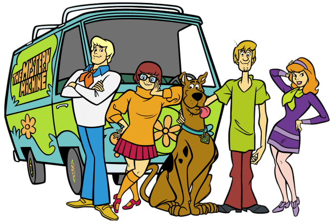
Mystery Machine Bus