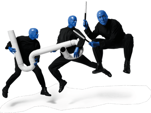
Blue Man Group Bus